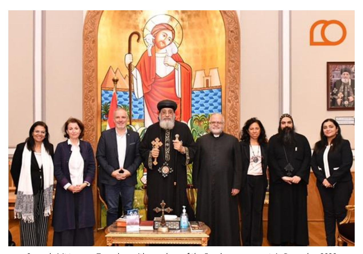
Second visit to pope Tawadros with members of the Focolare movement, in December 2020

https://jc2033.world/en/news/blog/327-egyptian-chronicles