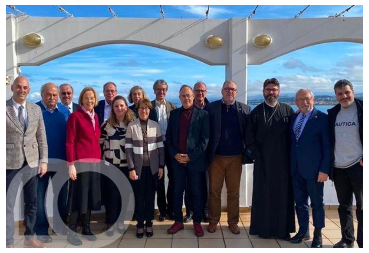
A joint initiative of the Interparliamentary Assembly on Orthodoxy, the Focolari's "Centro Uno", Together for Europe, Center of Ecumenical, Missiological and Environmental Studies "Metropolitan Panteleimon Papageorgiou" (CEMES), JC 2033 and the Orthodox Academy of Crete (OAC).

The initiative "Easter Together 2025" focuses on the decisions of the Council of Nicaea, with, first of all, a call to find unity around the date of Easter. It also calls for a common vision to witness to the Resurrection of Jesus, as the Council of Nicaea defined the Christian Faith by placing the Resurrection of Christ at its centre.