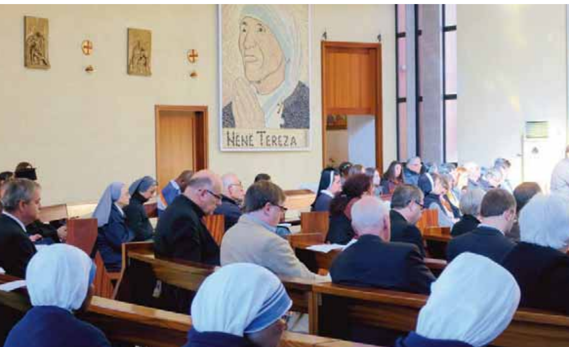
Below: Morning prayers at St. Paul's Catholic Cathedral, Tirana.