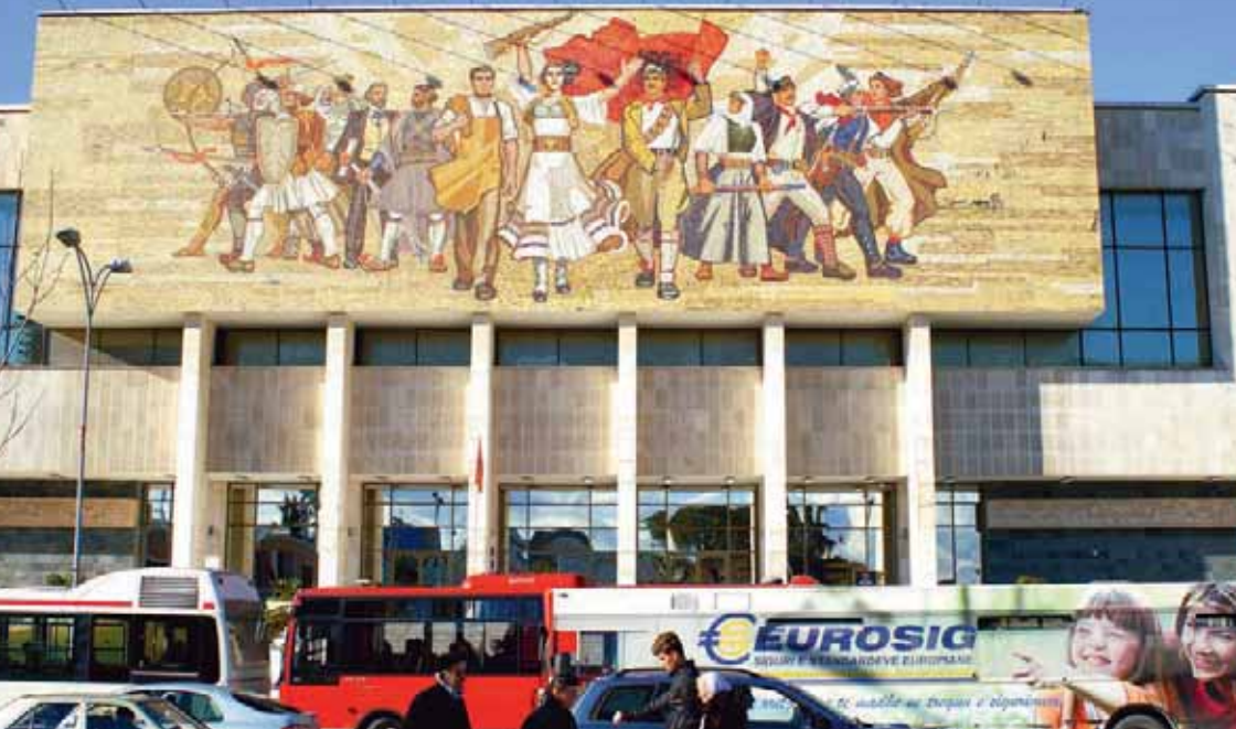
Above: A Communist era mural dominates the entrance of the National Museum, Tirana. The museum includes a section dedicated to those of all faiths who were persecuted during the time of Albania's aggressive atheistic policies. The Albanian experience of religious oppression was an important backdrop for the global consultation.