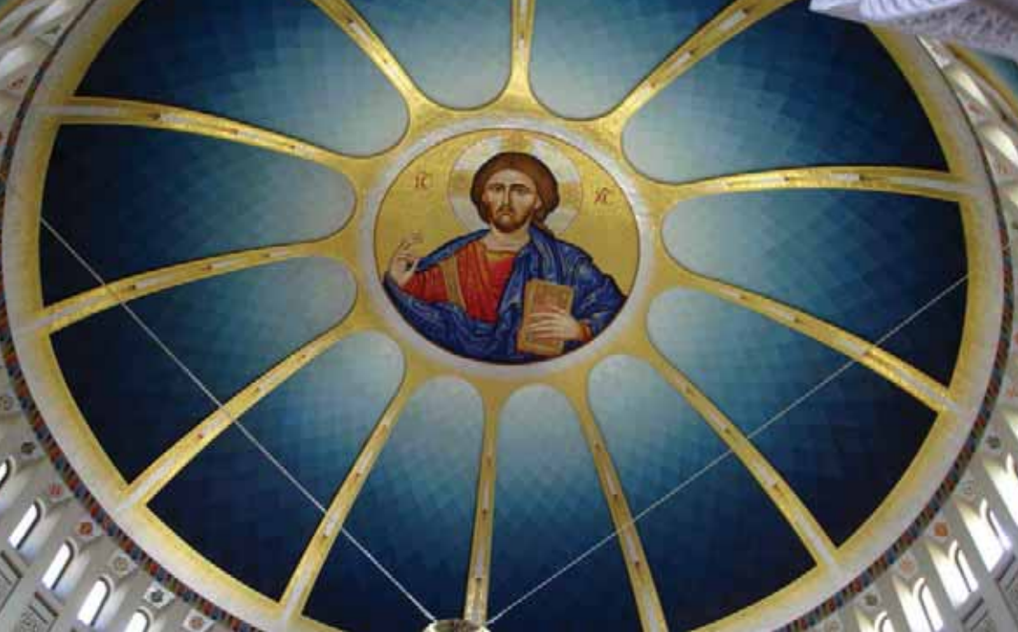
Above: Pantocrator mosaic, dome of the Resurrection of Christ Orthodox Cathedral, Tirana, Albania.