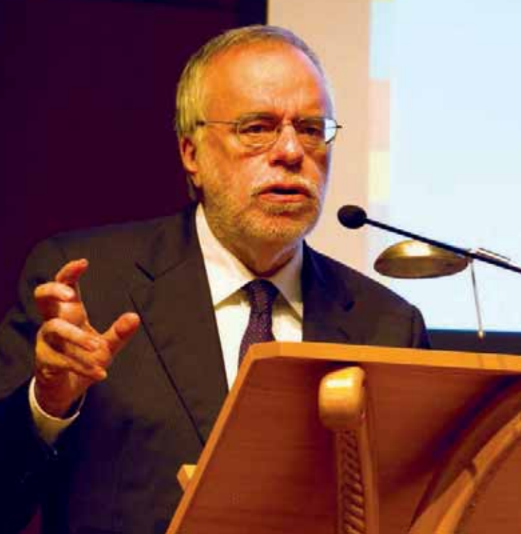
Left: Prof Dr Andrea Riccardi, Community of Sant'Egidio, delivers the keynote speech.