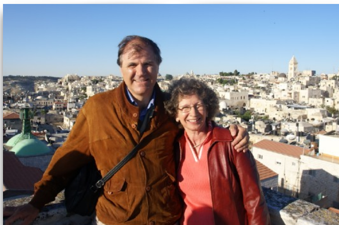
In Jerusalem in 2008

Thank you, dear friends, for your prayers and support for this wonderful project. I wish you a summer full of discoveries and blessings.